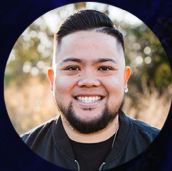
YOUTH CAMP 2 JUNE 3 - 7 CHRISTOPHER REYNOLDS